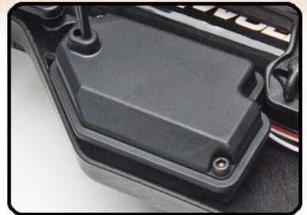
Water-resistant enclosed receiver box