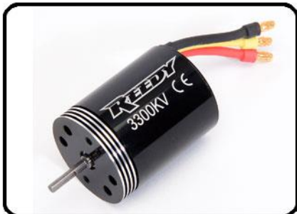
Reedy 3300kV brushless motor