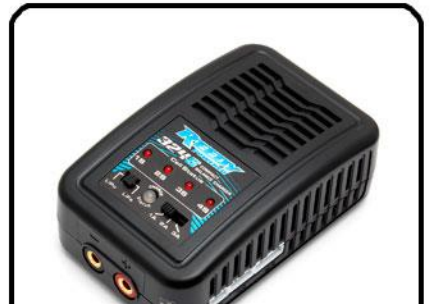
#27201 324-S Charger and #751 LiPo Battery are included