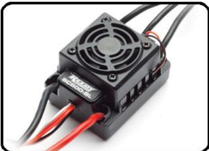
Water-resistant Reedy brushless electronic speed control