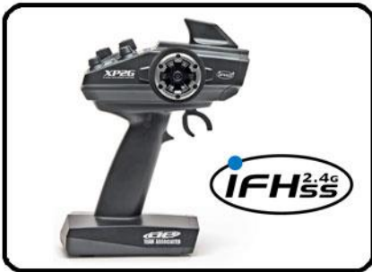
XP 2.4GHz radio system