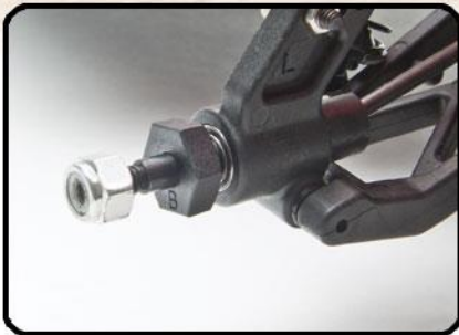
Hex drive wheels front and rear