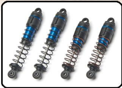
Fluid-filled blue aluminum v2 shock bodies front and rear