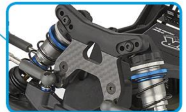
Heavy-duty V2 routed graphite front shock tower & tower guard

Due to ongoing R&D, photos may not match final kit. Vehicle shown on these pages equipped with items NOT included in kit: Reedy #27402 motor, #27322 battery, #27004 ESC, #27101 servo, receiver, wheels, tires, and pinion gear. Assembly and painting required.