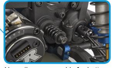
New slipper assembly for better weight balance and shock clearance