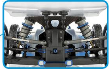
Heavy-duty V2 routed graphite rear shock tower, standard height