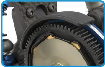
Molded spur gear guard to help protect body from damage