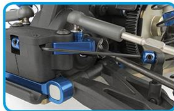
Front and rear anti-roll bars limit chassis roll for increased corner speed