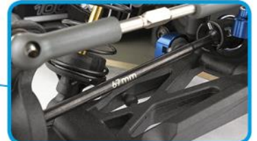
Heavy-duty V2 rear axle with 67mm bones