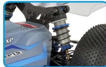
V2 springs for more reactive and nimble feel