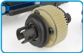
Differential height adjustment with 0, 1, 2, and 3mm inserts included