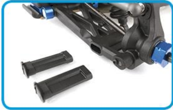
Innovative rear arm with molded inserts for ultra-fine lower shock mount adjustment