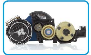
3-gear Laydown Stealth® transmission