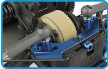
Easy-access ball differential