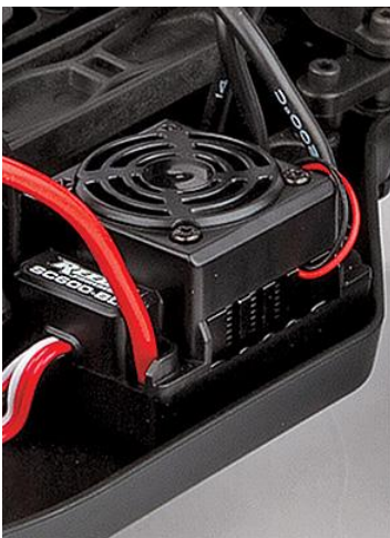
Water-resistant, high-power Reedy brushless speed control

*Weight will vary depending on the type of battery used to run your T4.3 RTR.