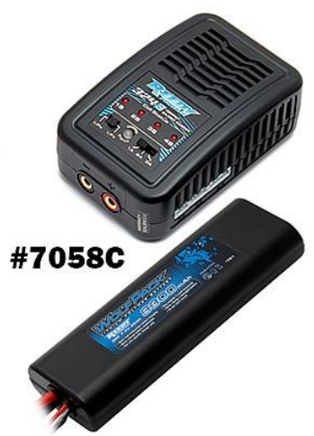
#7058C Combo only: Reedy Compact Balance Charger and Wolfpack LiPo 3300mAh battery