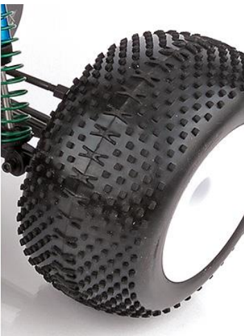
High traction compound tires on white hex drive wheels