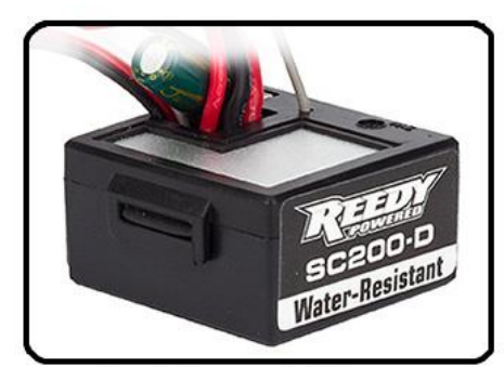
Reedy Powered all-in-one water-resistant speed control + receiver