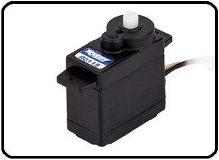
Reedy Powered servo