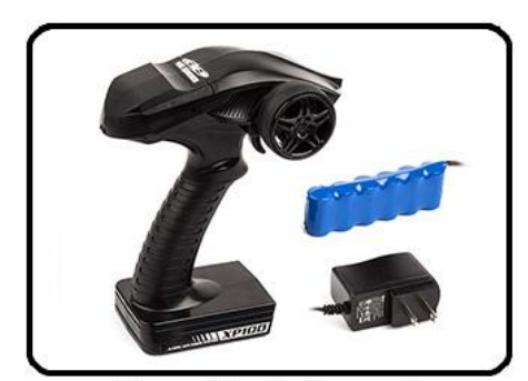
Transmitter, battery and wall charger