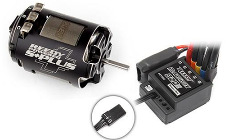
#27403C Blackbox 800Z ESC / Sonic S-Plus 13.5 Combo